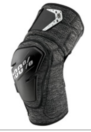
Knee - Heather Grey/Black