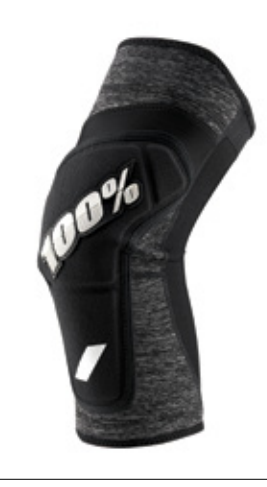
Knee - Heather Grey/Black