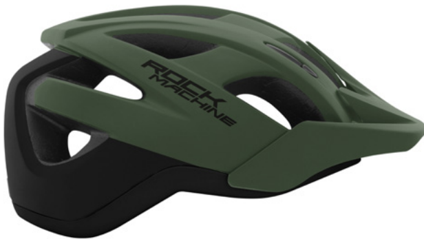
Helmet with Rock Machine logo product code RF050107