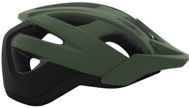
Helmet without logo product code AU050107