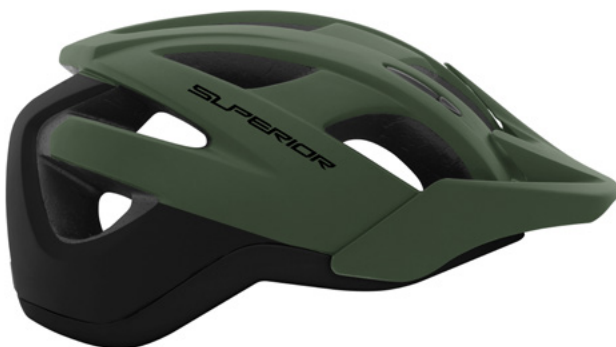
Helmet with Superior logo product code SF050107