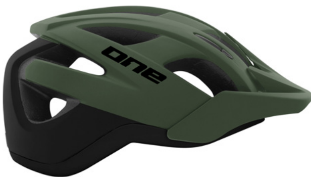
Helmet with ONE Bikeparts logo product code NF050107